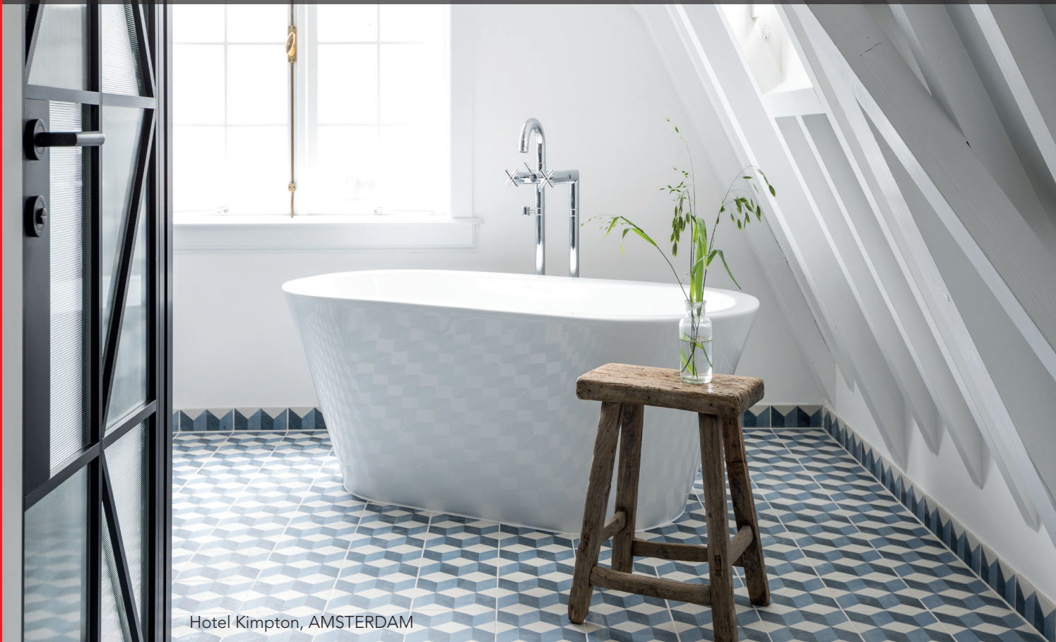
Hotel Kimpton, AMSTERDAM

"Thanks to its both modern and elegant appearance, products coated with Cosmos Black can be used in a range of applications." Evaluation of the Red Dot July 2019